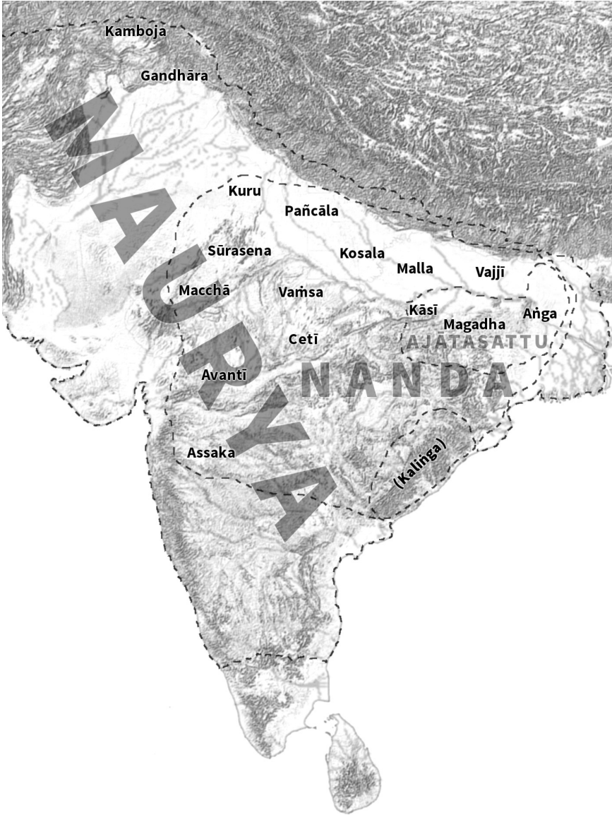
Figure 1.1: The 16 nations and the expansion of Magadha under Ajātasattu (c. 400 BCE), Mahāpadma Nanda (c. 350 BCE), and Candagutta Maurya (c. 300 BCE).